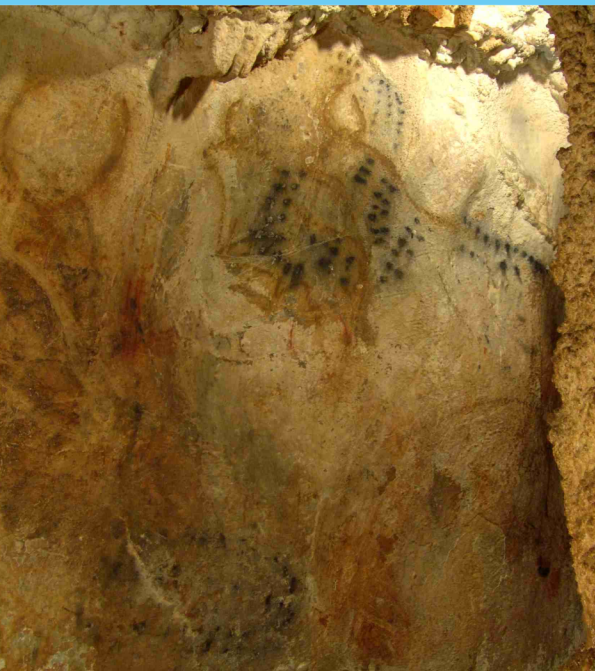
▲ Wall of engravings. Aurochs